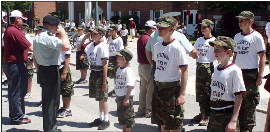
Returning summer campers at both the Confidence and Leadership levels were recognized in a front campus ceremony the first week of camp.

Camp activities included hiking, camping, canoeing, physical training, obstacle course, rappelling, tug-of-war, swimming, horseback riding, fishing, paintball, soccer, rifle, archery, military training, games in the student center and more. Campers