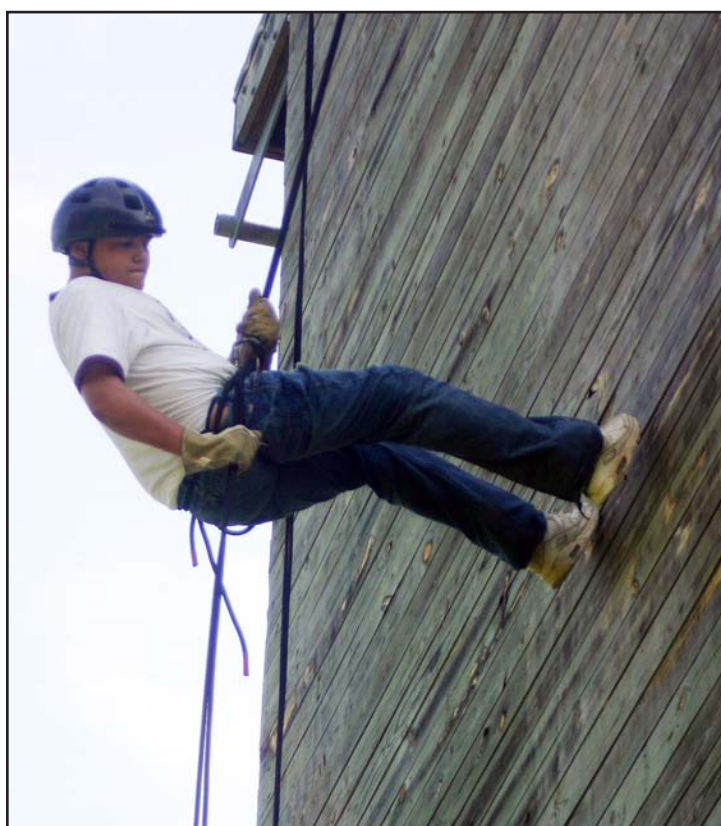
In photo at left, Leadership Campers paddle down the Steel River on a camping and canoeing trip. At right, campers conquered a 40-foot rappelling tower on back campus, and many had so much fun they went back for another try.