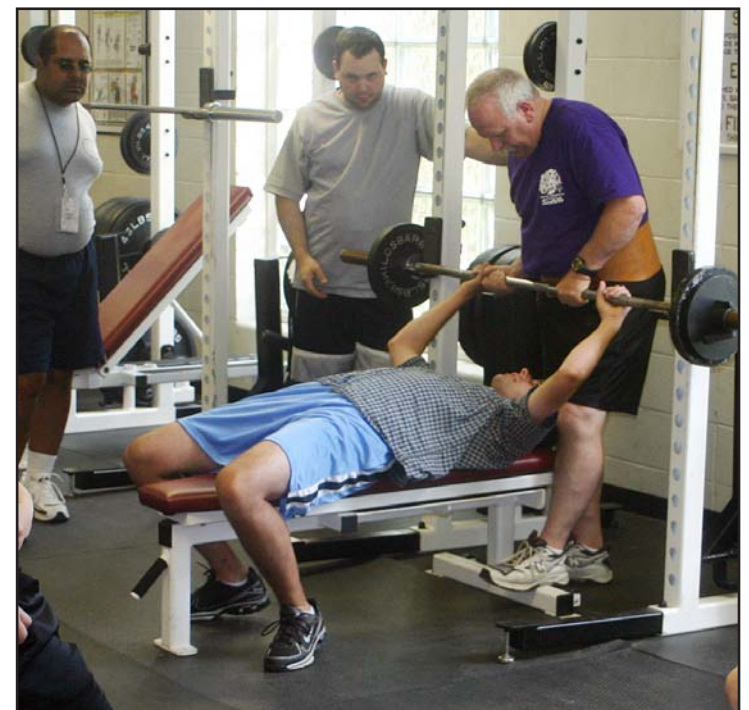
Missouri Military Academy hosted several outside camps and events over the summer, including the Missouri Pageant, Missouri Special Olympics Training Camp, Aquinas Parish Academic Camp and Granby Wrestling Camp. Here, Special Olympians train in MMA's state-of-the-art weights room.