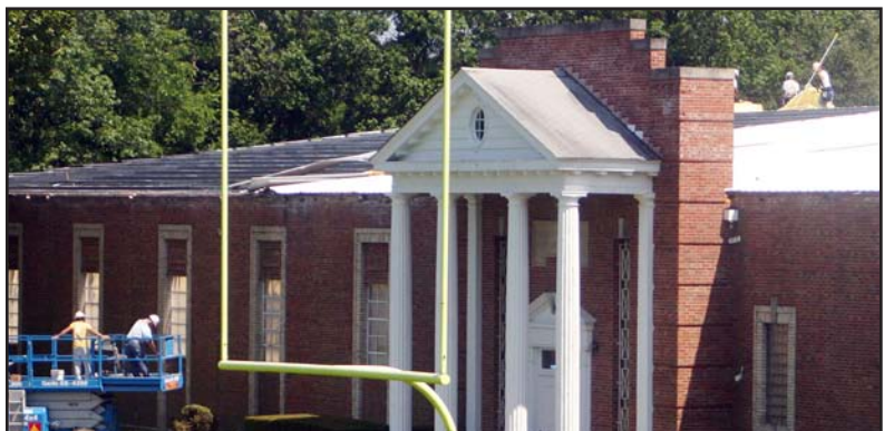
Top photo, workers drill into the ground to set the foundation for the new MMA Academic Building to be completed in July 2009. Below, contractors work on the roof of the MMA Fieldhouse, to be completed in September.