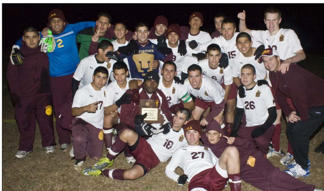
The top-seeded host Missouri Military Academy soccer team won the Class 1, District 7 title for the third consecutive season with a 3-2 victory over Canton on Nov. 4. The Colonels fell to Fatima in Westphalia, 2-1, in overtime of the sectional state playoff round on Nov. 9.