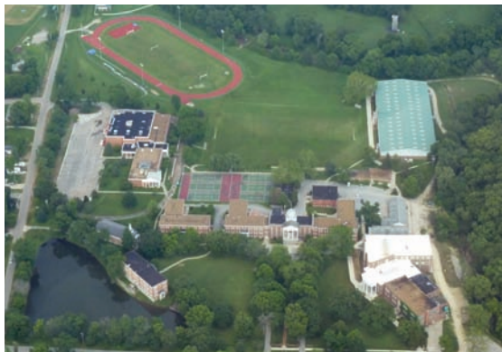
The MMA campus today. The building with the white roof is Barnard Hall, the first LEED-certified high school in Missouri.

Our history of success and dedicated leadership have allowed the Academy to continue to thrive while similar schools have struggled. In 2009, the Board of Trustees voted to adopt The Legacy Project: a five-year Strategic Plan that will expand and improve all aspects of the Academy, further cementing our place in the future.