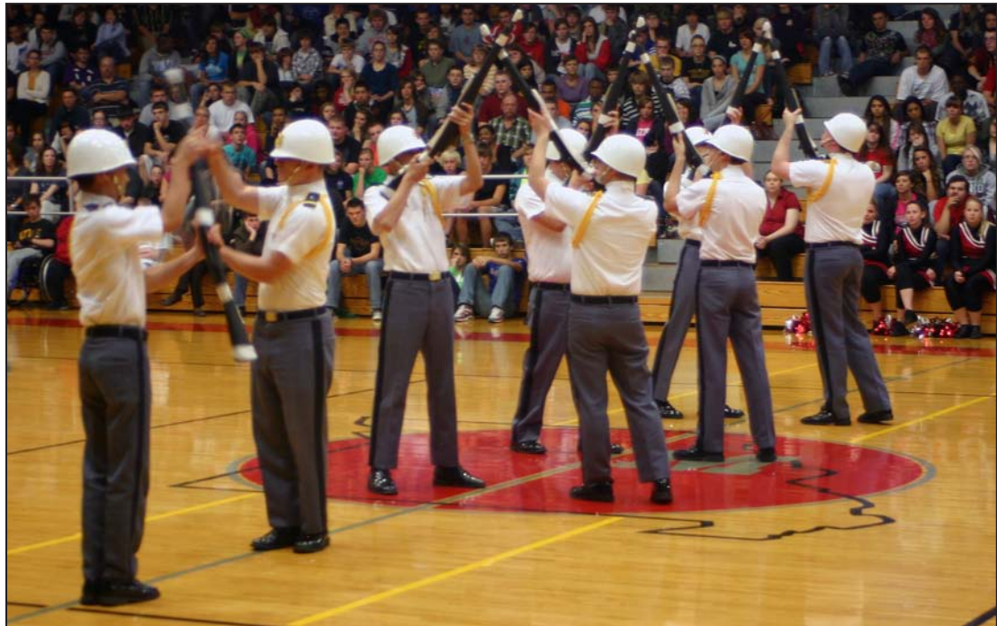
The Missouri Military Academy Fusileers drill unit performs for the combined MMA and Mexico High School student bodies during the first joint Veterans Day program in the MHS gymnasium on Thursday afternoon, Nov. 11.