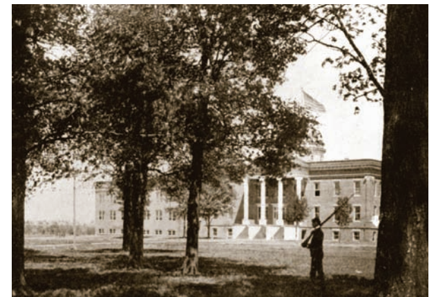
The MMA campus circa 1901 consisted of the main administration building and two residence halls.

This is a time when MMA calls upon our alumni and friends to establish their legacy at MMA by supporting our success. Although each strategic priority requires a different level of financial support, increased participation at all levels on behalf of every alumnus, parent and friend will move us closer to our goals. Now, more than ever, Annual Fund contributions are crucial to our mission and will determine the successful completion of the Legacy Project.